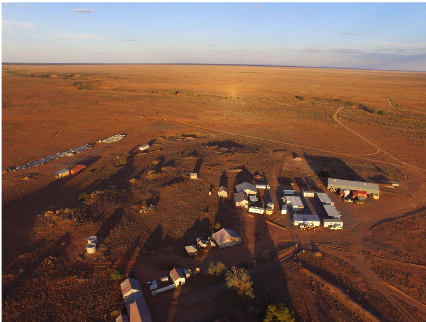
Photo overlooking Kalkaroo Station and Kalkaroo Copper-Gold Project area