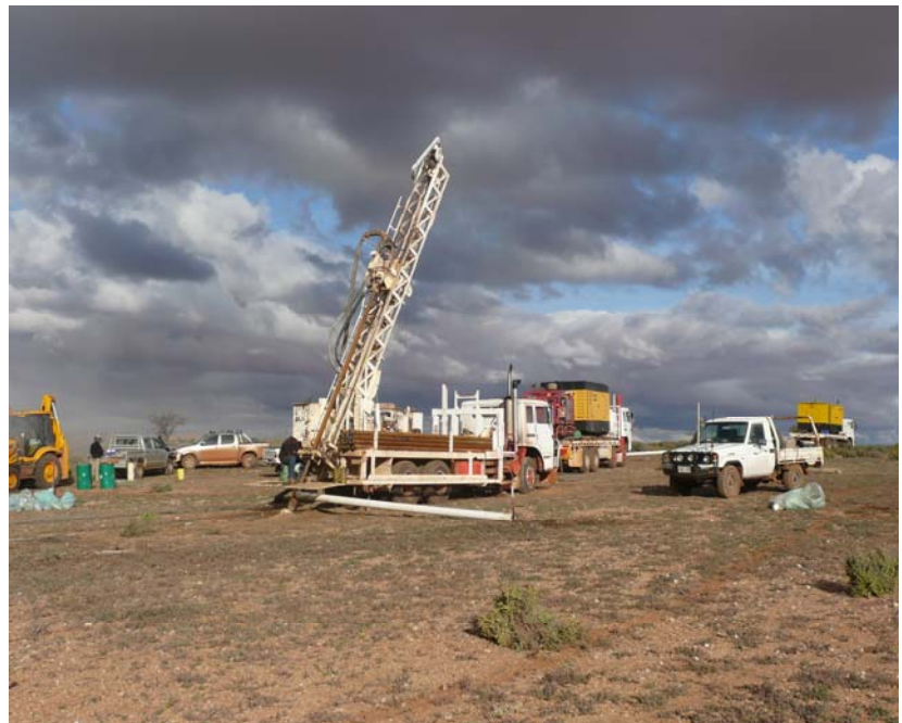
Recent drilling at the Maldorky iron ore project