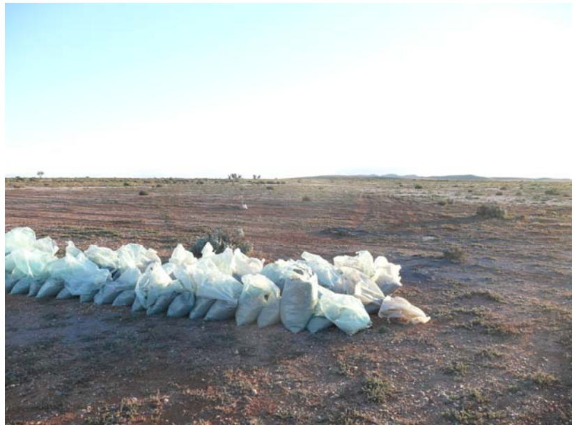
Low rise at Maldorky that recent drilling is revealing to be largely underlain by Braemar Iron Formation

Current drilling has focused on determining the down dip extension of the iron ore zone along one of the central drill section lines. This has now revealed that the entire low ridge appears to be a dip slope composed of iron ore with little or no overburden. Dips measured from surface outcrops are near horizontal (<20 degrees). Drillhole intersections with up to 139m thickness of ore occur in adjacent drillholes 50m apart confirming that a subhorizontal ore zone exists.