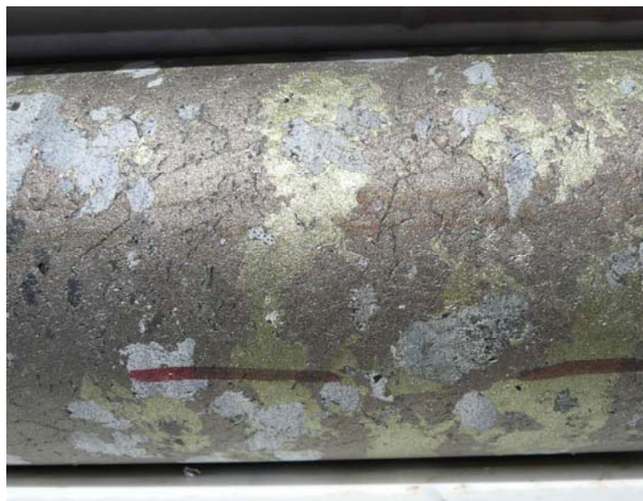
Primary sulphide ore, Mutooroo