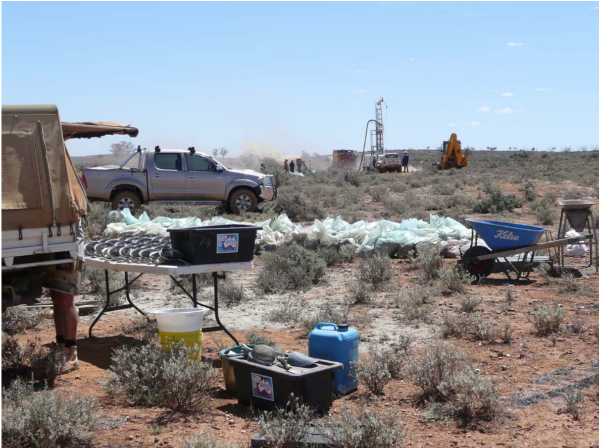
Drilling at the Lilydale iron ore project in February 2010